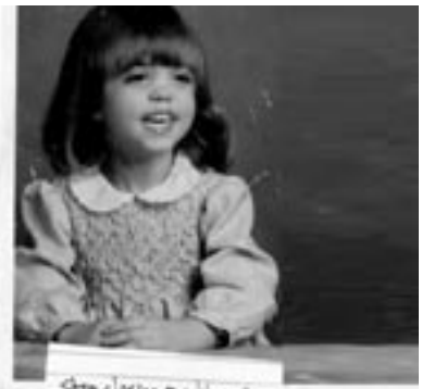
Stop closing my lipeneise

10pm. Mohawk Place, 47 E. Mohawk St. (855-3931) www.mohawkplace.com. $10.