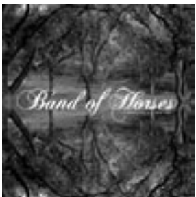
Band of Horses Everything All the Time (Sub Pop)