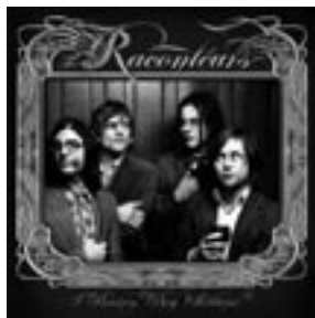
The Raconteurs Broken Boy Soldiers (V2)