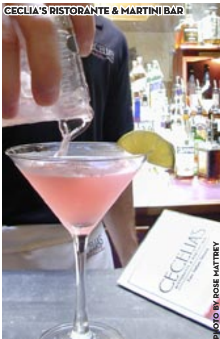
CECELIA'S RISTORANTE & MARTINI BAR