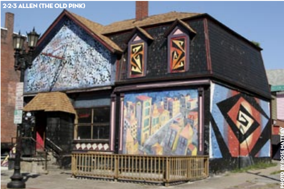
2-2-3 ALLEN (THE OLD PINK)

Three of our Best Dive Bar nominees are conspicuously located in a two-block section of Allen Street— Mulligan's Brick Bar , The Old Pink and Nietzsche's . All we can say is that we think they're raising property values in the neighborhood. When it comes down to it, every bar is simply a gathering place. But only particularly friendly, long-established saloons are deemed Best Neighborhood Pub . Among those nominated are