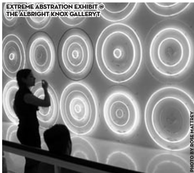
EXTREME ABSTRACTION EXHIBIT @ THE ALBRIGHT-KNOX GALLERY