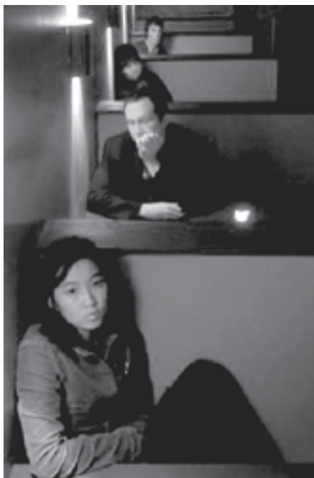
above: Sleeping Kings of Iona , below: Milk Fat are other featured acts in the Rockin' at the Knox series

Perhaps one of the most interesting wrinkles in the Blondie story is that the band hit it really big in the late 1970s and early 1980s—Harry's great looks landed her on countless magazines and they were in extremely heavy rotation on early MTV—and then, after the 1982 album The Hunter , Stein became ill and the band broke up. It was puzzling for fans who'd come to depend on the band to put out clever, sexy songs to have them simply vanish. Truly a case of “here today, gone tomorrow.” But then, 16 years later, comes the album No Exit and the number one hit single