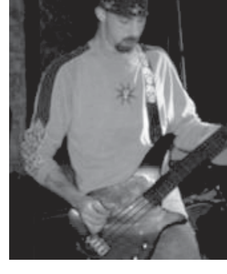
Group name: Siriun Geometry When/where playing this week?

Monday, June 26 at Palmeri's, 1514 Pine Avenue, Niagara Falls. As part of the UNITE! Tour with metal/punk bands Lexsis Jumps and One Win Choice.