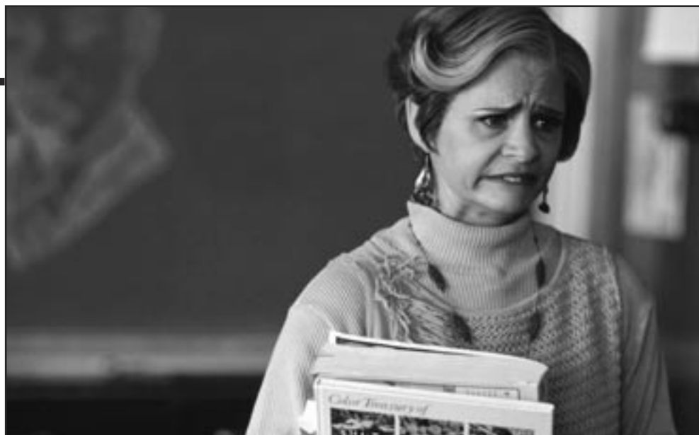
Amy Sedaris in Strangers with Candy