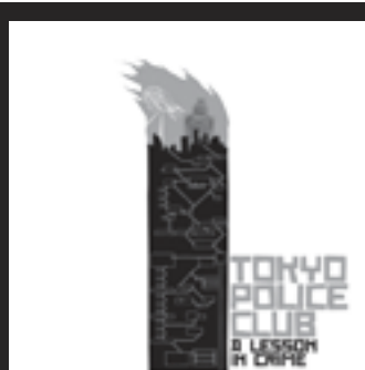
Tokyo Police Club A Lesson in Crime (Paper Bag Records)