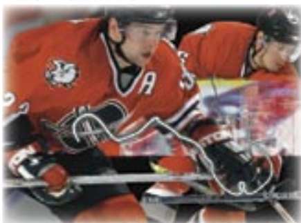
THE BUFFALO SABRES