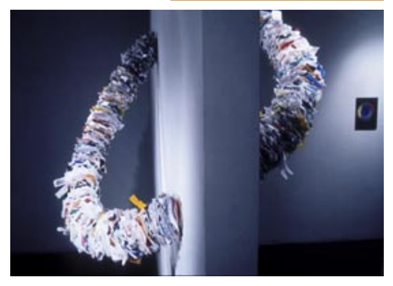
September 16-January 7: CRAFT ART WESTERN NEW YORK 2006

Five upcoming gallery shows to mark on your calendar