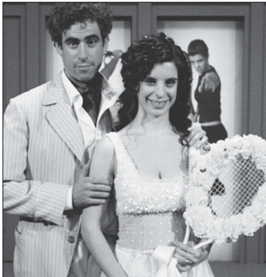
Stephen Mangan and Meredith MacNeil in Confetti