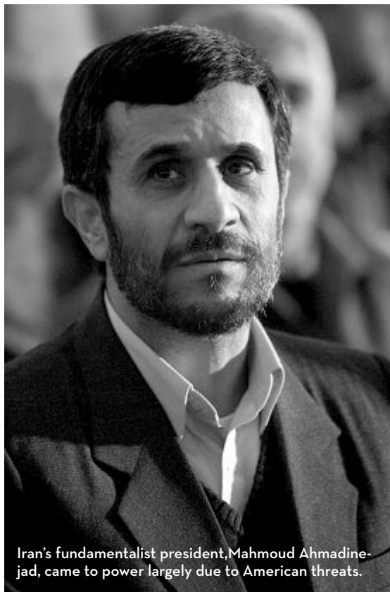
Iran's fundamentalist president, Mahmoud Ahmadinejad, came to power largely due to American threats.

Twenty-seven years ago, President Jimmy Carter gave his most famous address, since dubbed the "Malaise Speech." Rather than take a Republican "vote for me and you can eat all the ice cream you want, never get fat and drive your SUVs forever" approach to government, Carter warned the nation that our addiction to Mideast oil was killing us, and that we had to address it immediately.