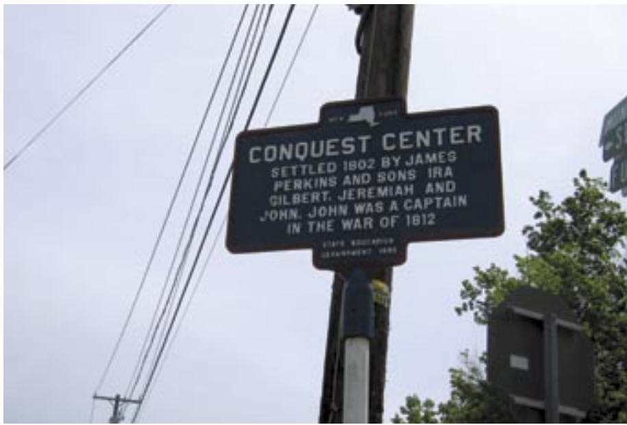
The historic town of Conquest, New York, north of the Montezuma National Wildlife Refuge, is just five miles down the road from the slightly less historic town of Victory, New York.

morning we read the paper at a beautiful old diner on Genesee Street, overlooking the Genesee River, site of the Duck Derby, channeled through town between 20-foot concrete walls. The eggs and home fries were terrible, but the service was friendly and informative: The waitress gave us directions to the home of Harriet Tubman, a mile or so out of town.