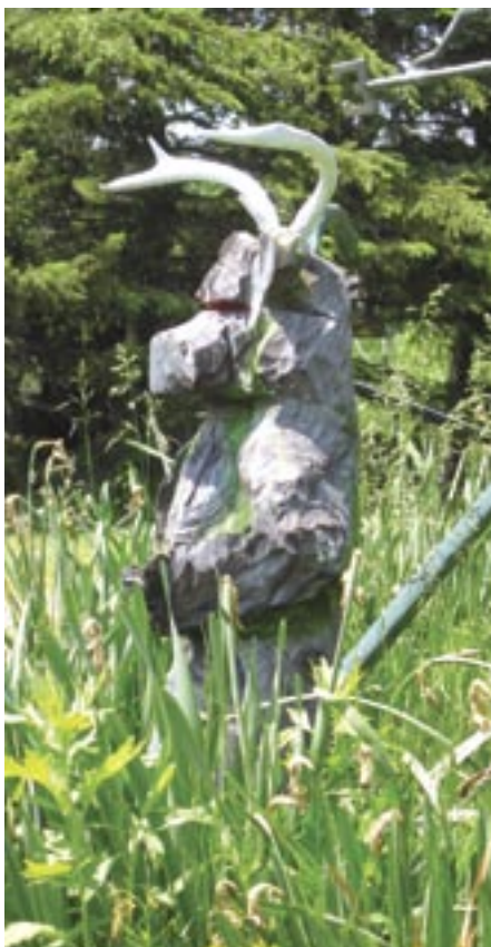
A carved bull in a yard full of wood sculptures on a country road between Auburn, New York and Lake Ontario. The sculptor's wife said he'd seen similar sculptures in Rochester and liked them so much he was inspired to teach himself.

She used to go driving, too, she told us, when she learned of our plans. All the way out to the Finger Lakes, just to get out of town. When she was younger.